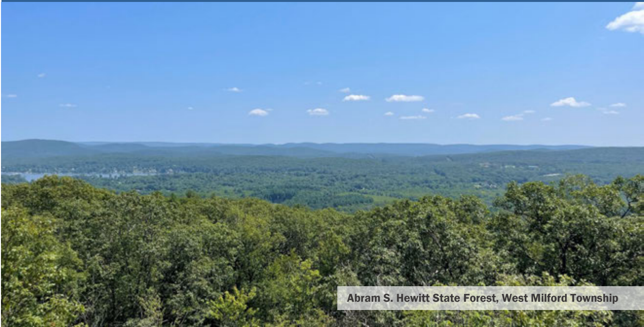
Abram S. Hewitt State Forest, West Milford Township