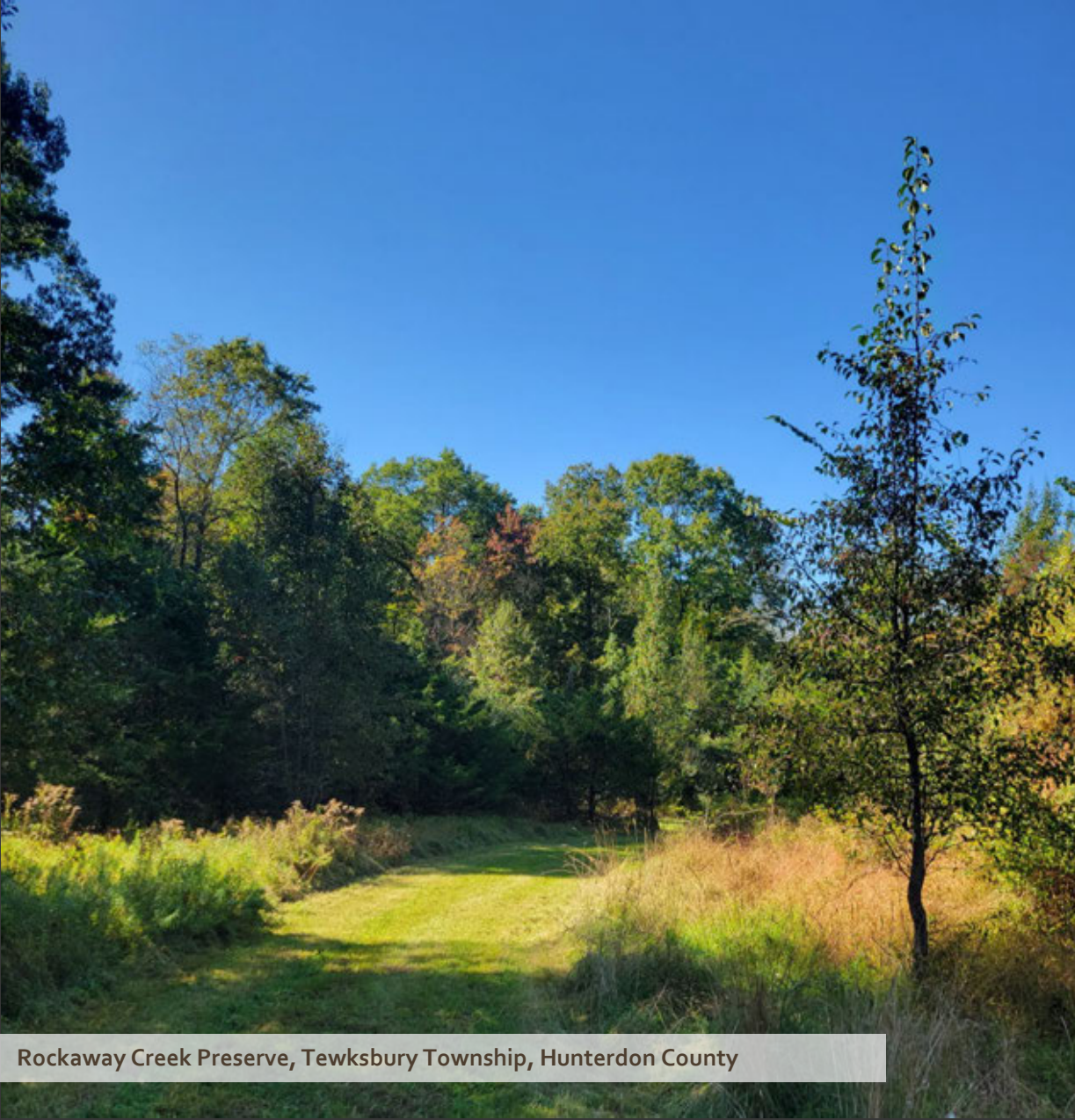
Rockaway Creek Preserve, Tewksbury Township, Hunterdon County